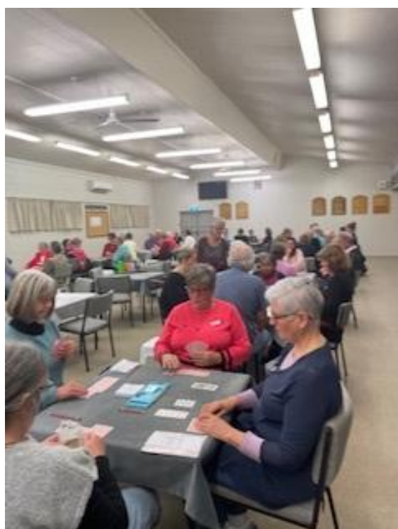
Attendees at Welcome Night

"Thanks to the club members who put on such a fabulous graduation dinner on Wednesday and thanks to the people who must have come early to make the room look so inviting. The tables looked beautiful."